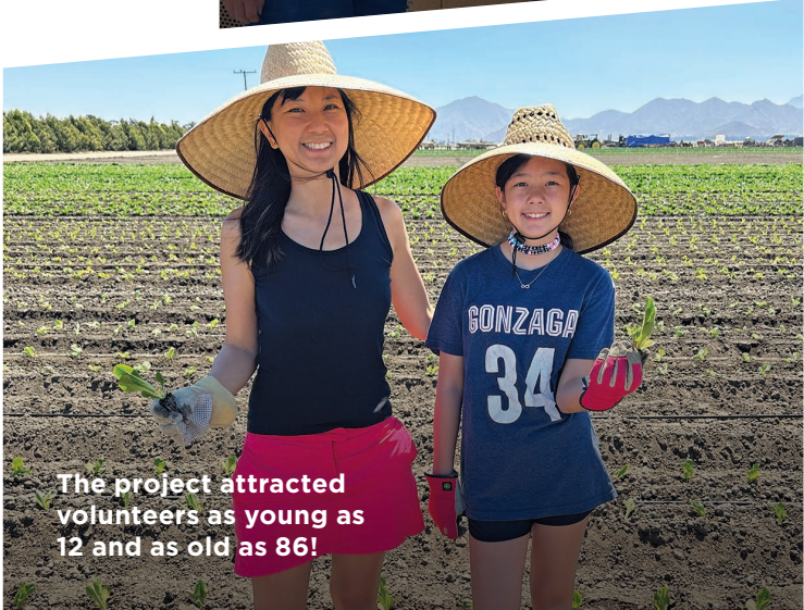
The project attracted volunteers as young as 12 and as old as 86!