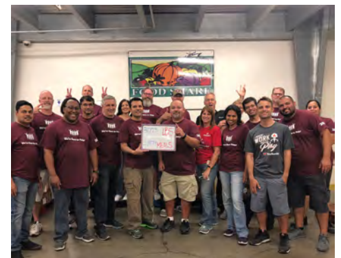
A team from Tax Audit Company packed 3,775 pounds of food, 2,979 or meals!