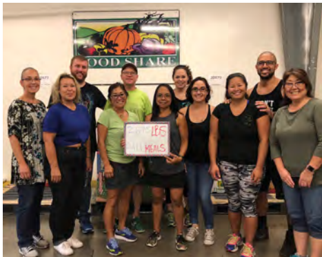
Halau Hula O Pualani packed 2,675 pounds of food, or 2,111 meals!