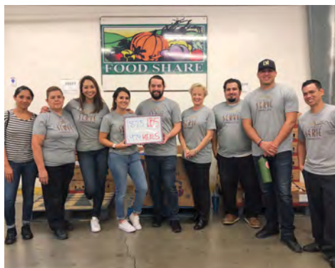
Marriott Hotels packed 1,875 pounds of food, or 1,479 meals!