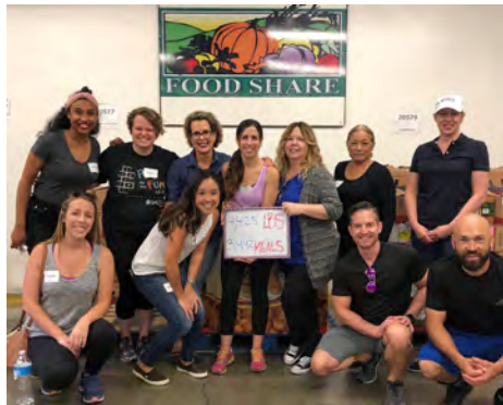
SAGE Publishing packed 4,425 pounds of food, 3,492 or meals!