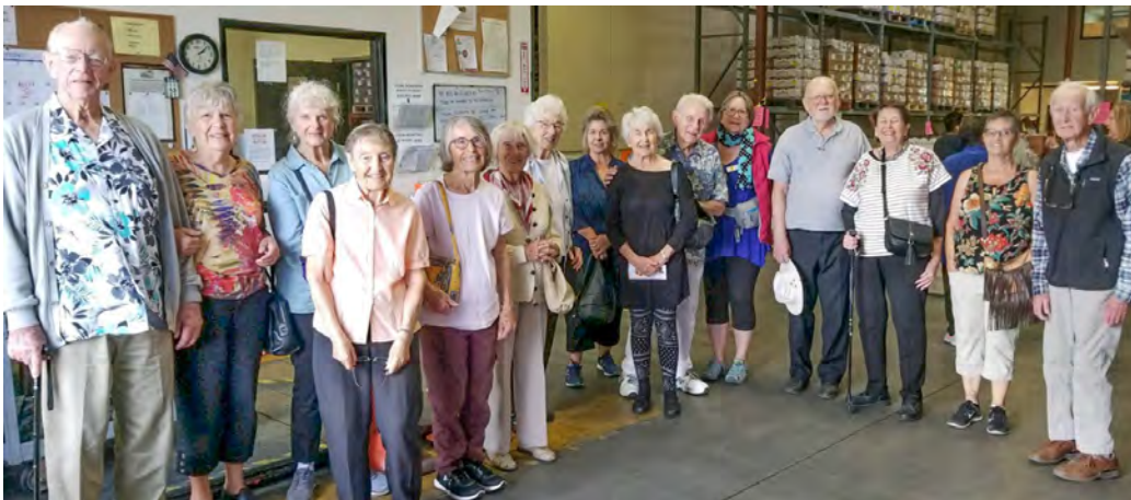
Unitarian Universalist Church of Ventura

If someone you know is interested in touring and learning more about FOOD Share, please contact the Volunteer Department to set up a date and time. We are flexible, and willing to accommodate your schedule. We encourage schools to come to visit and tour the facility. Please spread the word to any teachers or administrative staff you know in hopes of getting our youth more involved in helping to feed the hungry in our community.