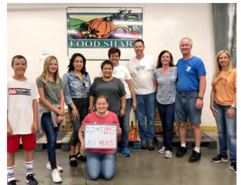
A group from the YMCA packed 2,295 pounds of food, or 1,811 meals!