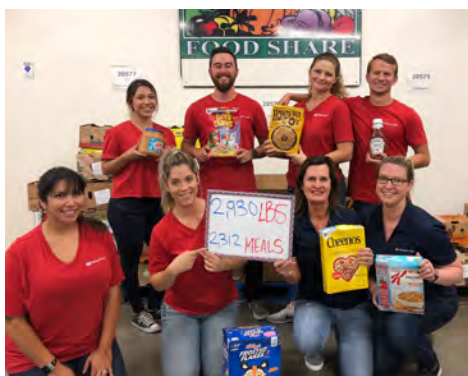
Accountemps packed 2,930 pounds of food, or 2,312 meals!