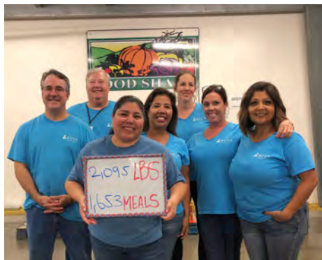
A team from Life Insurance Central packed 2,095 pounds of food, or 1,653 meals!