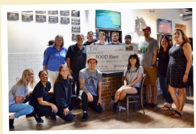
Institution Ale Co.

Through the Piece of the Pie Fundraiser in the month of June, Institution Ale Co. raised $3,431. With every pizza and pretzel purchase, IAC donated a meal back to FOOD Share! Thank you to all who participated and helped make this possible.